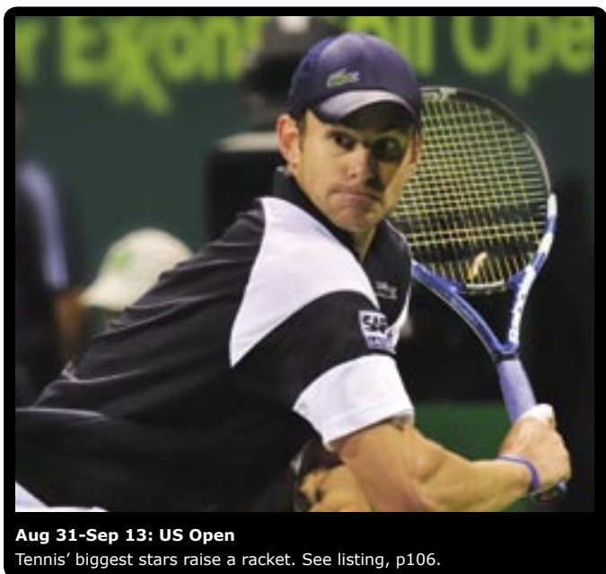
Aug 31-Sep 13: US Open