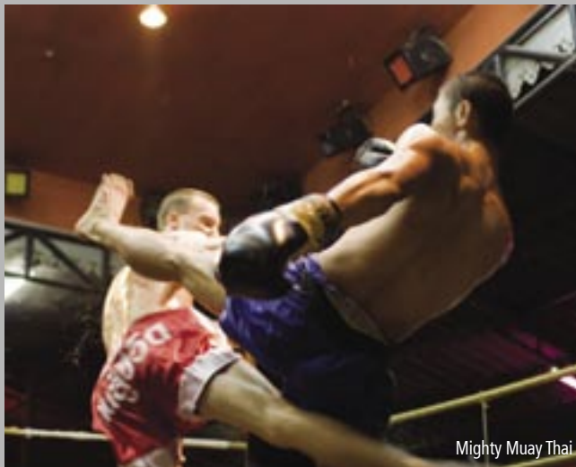
Mighty Muay Thai

Combat has been around as long as time, and the East has given the world some of its more graceful techniques. Often shrouded in mysticism and linked with a code of honor, these martial arts are known to instill discipline as well as deadly force. Use what you were born with to get all Jackson Pollock over the canvas that is your opponent's body.