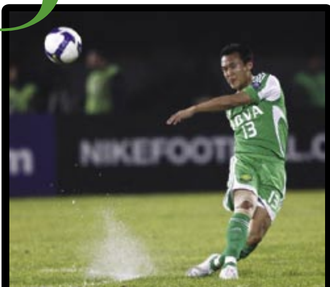
Sep 16: Beijing Guoan vs. Changchun Yatai Going all the way? See listing, this page.

All event listings are accurate at time of press and subject to change For team and venue details, see directories, p109 Send events to listings@thebeijinger.com by Sep 7