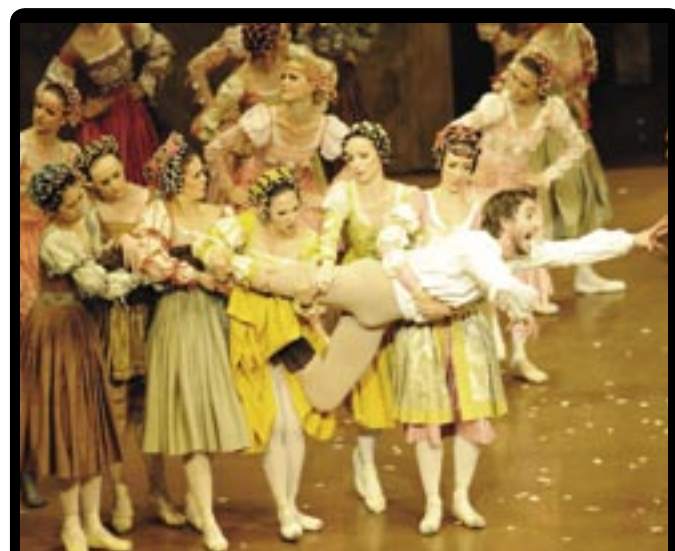
Oct 9-11: The Taming of the Shrew

Great Hall of the People Daily 8.30am-3pm, but closed during government meetings. RMB 30, RMB 15 (children). West side of Tian'anmen Square, Dongcheng District. (6309 6156) 人民大会堂, 东城区天安门广场西侧