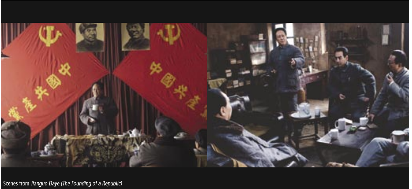
Scenes from Jianguo Daye ( The Founding of a Republic )