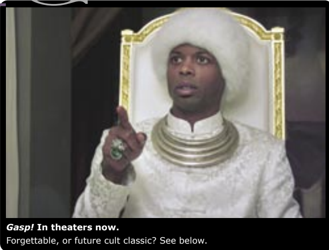
Gasp! In theaters now. Forgettable, or future cult classic? See below.

All event listings are accurate at time of press and subject to change For venue details, see directories, p83 Send events to listings@thebeijinger.com by Oct 12