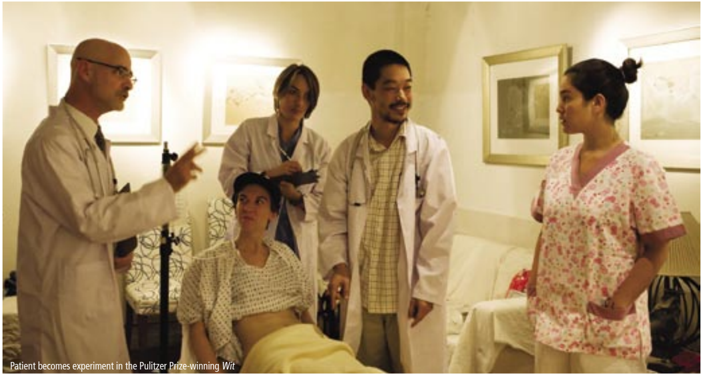
Patient becomes experiment in the Pulitzer Prize-winning Wit