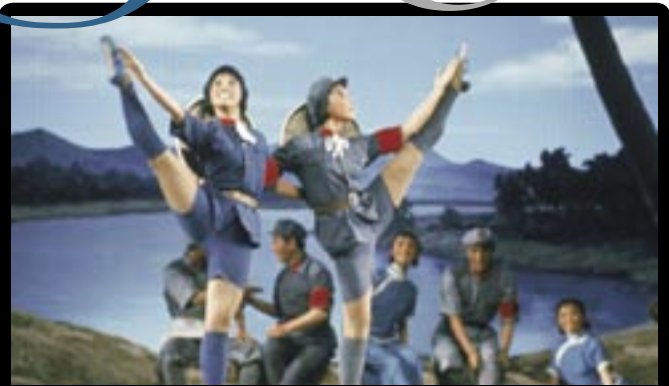
Oct 2-3, 30-31: The Red Detachment of Women Chairman Mao says, "Women hold up half the sky." See listing, p87.

Turandot will be performed on Oct 6 and 7 in the National Stadium (Bird's Nest). RMB 180-3,800. 7.30pm.