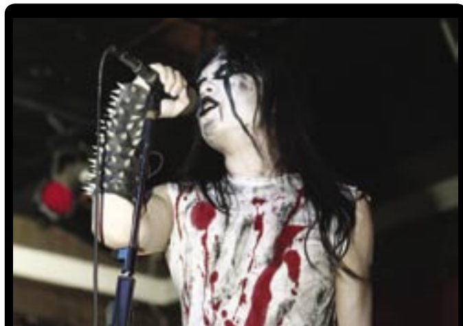
Feb 5: Evilthorn

Moreno Donadel Trio Italian pianist collaborates with a few Beijingers. Free. 9.30pm. East Shore Live Jazz Cafe (8403 2131)