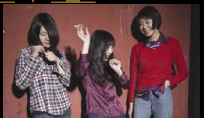
Feb 6 & 27: Ourself Beside Me

Send events to listings@thebeijinger.com by Feb 10